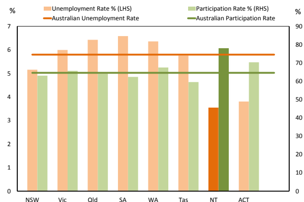
Chart 1: Unemployment and Participation Rates