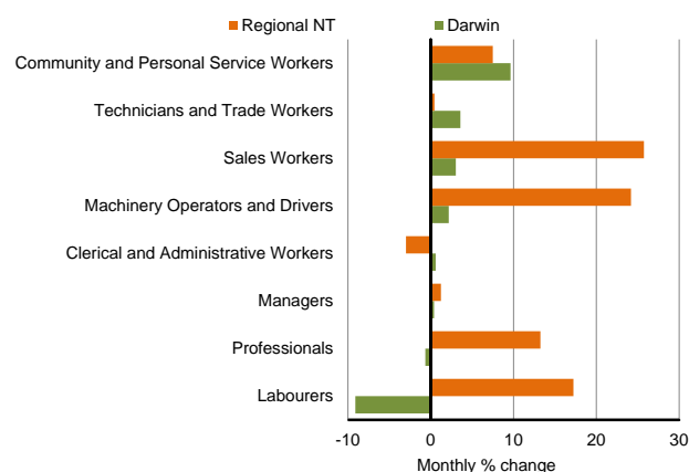
Chart 2: Northern Territory Job Vacancies