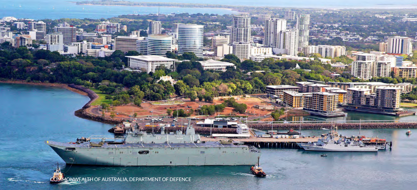
COMMONWEALTH OF AUSTRALIA, DEPARTMENT OF DEFENCE

Territory based businesses have proven experience in delivering on defence construction projects. Numerous Northern Territory construction firms are experienced second and third tier defence contractors and several have undertaken head or managing contractor roles for significant defence projects. This presents opportunities for whole-of-life cost savings and other long-term advantages. The Northern Territory construction industry is experienced in delivering projects in regional and remote areas of the Northern Territory. The study also found that majority owned Aboriginal businesses were represented in 36 of the scopes mapped.