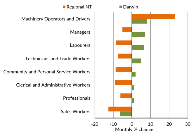
Chart 2: Northern Territory Job Vacancies