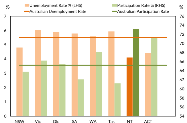
Chart 1: Unemployment and Participation Rates