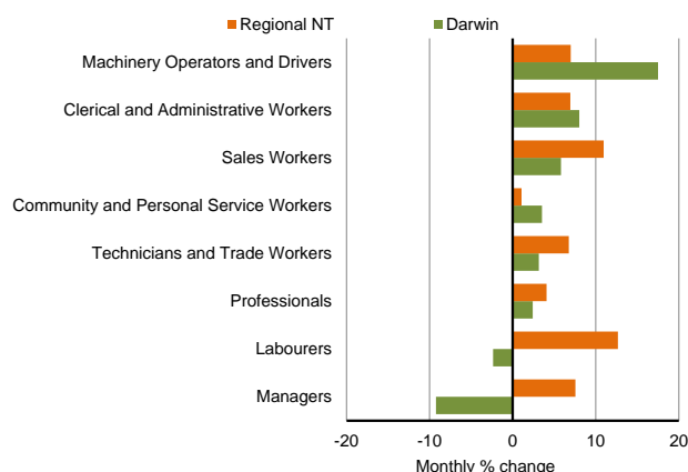
Chart 2: Northern Territory Job Vacancies