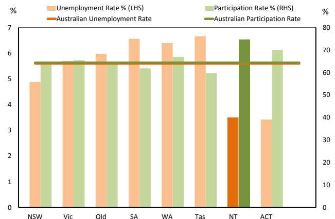
Chart 1: Unemployment and Participation Rates